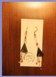
Coconut Earrings $5.00