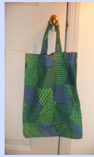
Small Eco Bag $5.00