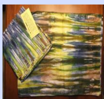
Placemats with Napkins (2) $12.00