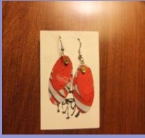
Soda Can Earrings $4.00