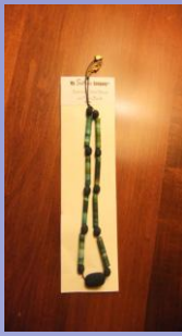
Fabric Bead & Seed Necklace $12.00