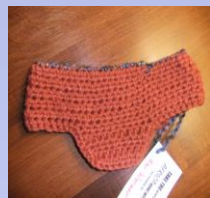
Crochet Ear Warmer $2.00