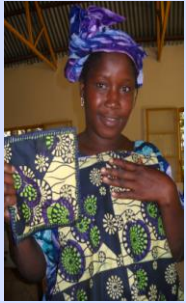
Apron/Pot Holder Set $14.00