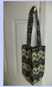
Lined Bag $8.00