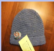
Crochet Hat $8.00