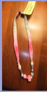
Fabric Knot Necklace $12.00