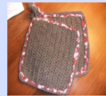
Crochet Pot Holder (2) $10.00