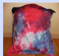
Pillow Cover $6.00