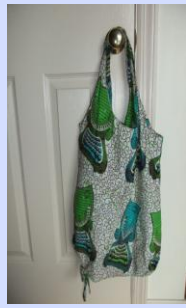
Large Eco Bag $7.00